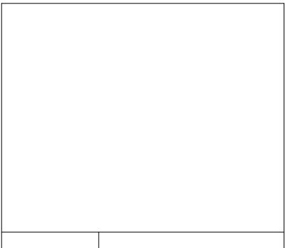
DETAIL 2 ANCHOR BOLT